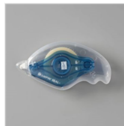
Stampin' Seal+ - 149699