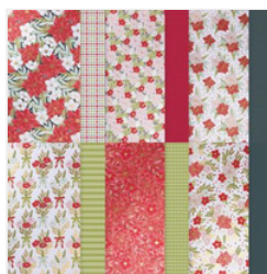
Traditions Of Christmas 12" X 12" (30.5 X 30.5 Cm) Specialty Designer Series Paper - 165853