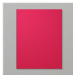
Real Red 8-1/2" X 11" Cardstock - 102482