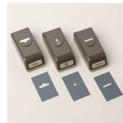
Hole Punch Assortment - 165409