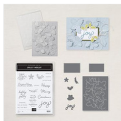
Jolly Holly Bundle (English) - 166120