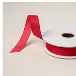
Real Red 1/2" (1.3 Cm) Shiny Ribbon - 165876