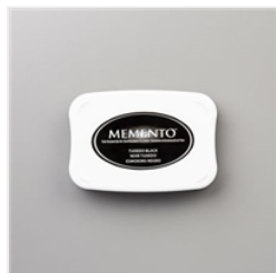
Tuxedo Black Memento Ink Pad - 132708