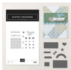
Playful Packaging Bundle (English) - 167600