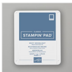
Misty Moonlight Classic Stampin' Pad - 153118