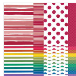
Regals Painted Patterns 12" X 12" (30.5 X 30.5 Cm) Designer Series Paper - 167757