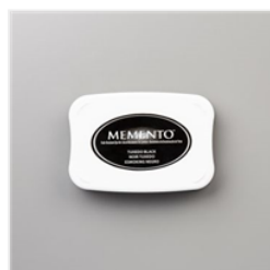
Tuxedo Black Memento Ink Pad - 132708