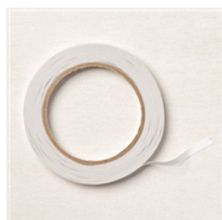
Tear & Tape Adhesive - 154031