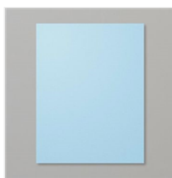
Balmy Blue 8-1/2" X 11" Cardstock - 146982