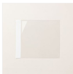
4" X 4" (10.2 X 10.2 Cm) Flip Flaps - 166512