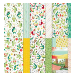
Turtle-Y Cute 12" X 12" (30.5 X 30.5 Cm) Designer Series Paper - 165221