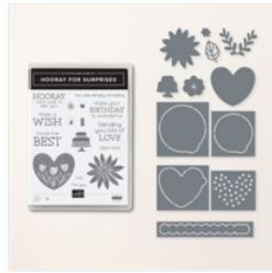
Hooray For Surprises Bundle (English) - 162858