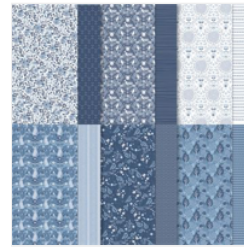
Countryside Inn 12" X 12" (30.5 X 30.5 Cm) Designer Series Paper - 161467