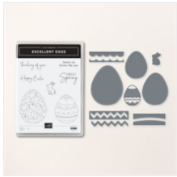
Excellent Eggs Bundle (English) - 162808

stampingwithmore@gmail.com http://www.stampingwithmore.com