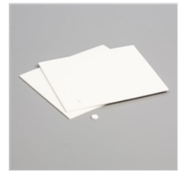
Mini Stampin' Dimensionals - 144108