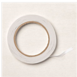
Tear & Tape Adhesive - 154031