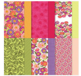
Flowering Zinnias 12" X 12" (30.5 X 30.5 Cm) Designer Series Paper - 163469