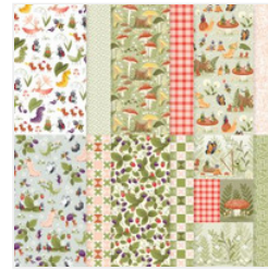
Cute As A Bug 12" X 12" (30.5 X 30.5 Cm) Designer Series Paper - 166994