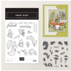
Sweet Bugs Bundle (English) - 167002

stampingwithamore@gmail.com http://www.stampingwithamore.com