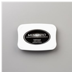
Tuxedo Black Memento Ink Pad - 132708