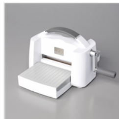
Stampin' Cut & Emboss Machine - 149653