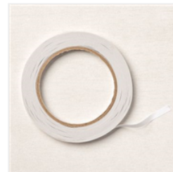
Tear & Tape Adhesive - 154031