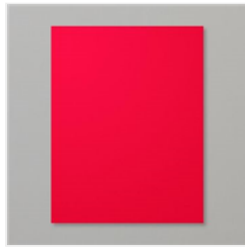
Poppy Parade 8-1/2" X 11" Cardstock - 119793