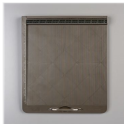
Simply Scored Scoring Tool - 122334