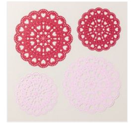
Lovely Doilies - 167104