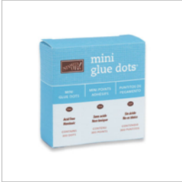
Mini Glue Dots - 103683