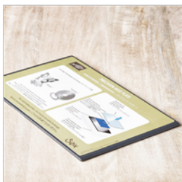
Precision Base Plate - 139684