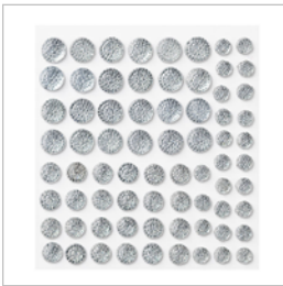
Clear Faceted Gems - 144142