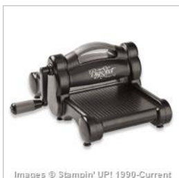
Big Shot - 113439