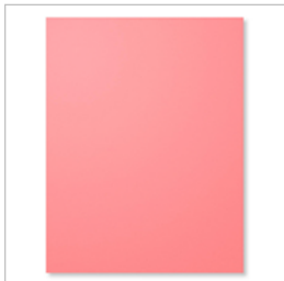
Flirty Flamingo 8-1/2" X 11" Cardstock - 141416