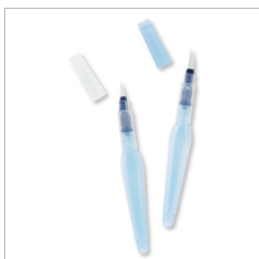
Aqua Painters - 103954