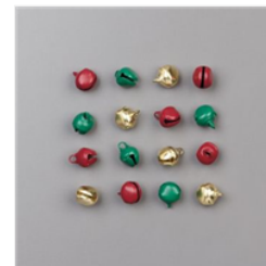
Jingle Bells - 149598