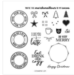
Warm Hugs Photopolymer Stamp Set (English) - 153478