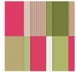
Heartwarming Hugs Designer Series Paper - 153492