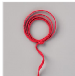
Real Red 3/16" (4.8 Mm) Braided Linen Trim - 153546