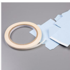
Tear & Tape Adhesive - 138995