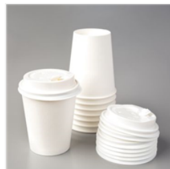
Mini Coffee Cups - 153493