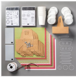
Heartwarming Hugs Suite Collection (English) - 155106