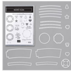
Warm Hugs Bundle (English) - 155145