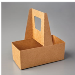
Mini Coffee Carrier - 153508