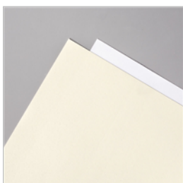
Very Vanilla 8-1/2" X 11" Thick Cardstock - 144237