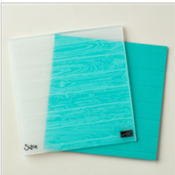
Pinewood Planks Dynamic Textured Impressions Embossing Folder - 143708