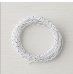
Silver Baker'S Twine - 145569