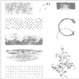
Timeless Textures Clear-Mount Stamp Set - 140517