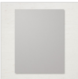
Gray Granite 8-1/2" X 11" Cardstock - 146983