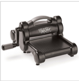
Big Shot - 143263