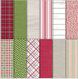
Festive Farmhouse 12" X 12" (30.5 X 30.5 Cm) Designer Series Paper - 147820