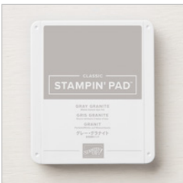
Gray Granite Classic Stampin' Pad - 147118