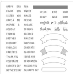
Thoughtful Banners Photopolymer Stamp Set - 141614