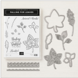
Falling For Leaves Photopolymer Bundle - 149938