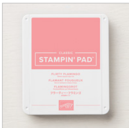
Flirty Flamingo Classic Stampin' Pad - 147052