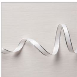
Silver 3/8" Metallic-Edge Ribbon - 144213