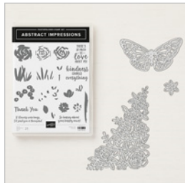
Abstract Impressions Photopolymer Bundle - 148348