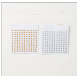
Metallic Pearls - 146282