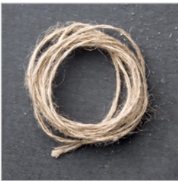
Linen Thread - 104199