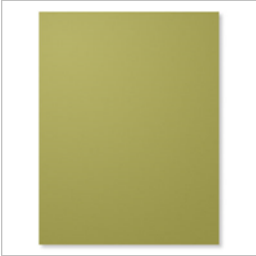
Old Olive 8-1/2" X 11" Cardstock - 100702

Laura Milligan laura@lauramilligan.com www.lauramilligan.com