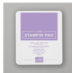
Highland Heather Classic Stampin' Pad - 147103