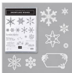
Snowflake Wishes Bundle (English) - 155172

Terri Brumagim tbrumagim@msn.com https://terribrumagim1.stampinup.net/