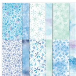
Snowflake Splendor Designer Series Paper - 153512