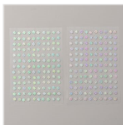
Adhesive-Backed Snowflakes - 153545