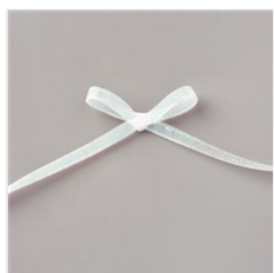
Snowflake Splendor 1/4" (6.4 Mm) Ribbon - 153548