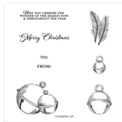
Cherish The Season Cling Stamp Set - 153417