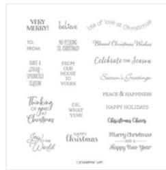
Itty Bitty Christmas Cling Stamp Set (En) - 150513