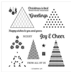
Tree Angle Photopolymer Stamp Set - 153442

tarabethstamps@gmail.com tarabethstamps.blogspot.com