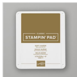
Soft Suede Classic Stampin' Pad - 147115