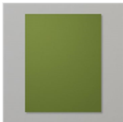
Mossy Meadow 8- 1/2" X 11" Cardstock - 133676