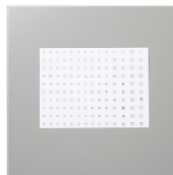
Rhinestone Basic Jewels - 144220