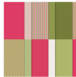
Heartwarming Hugs Designer Series Paper - 153492