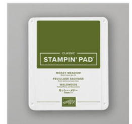
Mossy Meadow Classic Stampin' Pad - 147111