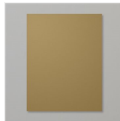
Soft Suede 8-1/2" X 11" Cardstock - 115318