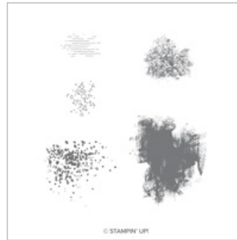
Artisan Textures Clear-Mount Stamp Set