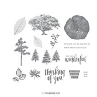
Rooted In Nature Clear-Mount Stamp Set