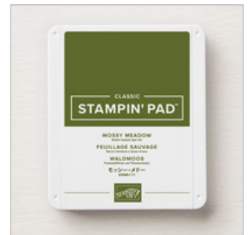
Mossy Meadow Classic Stampin' Pad