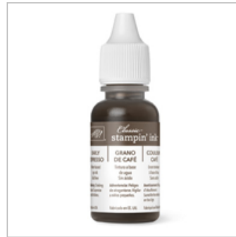
Early Espresso Classic Stampin' Ink