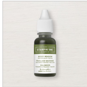
Mossy Meadow Classic Stampin' Ink