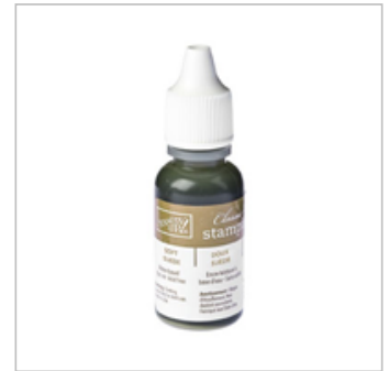
Soft Suede Classic Stampin' Ink Refill