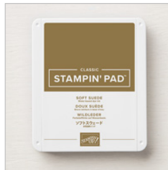
Soft Suede Classic Stampin' Pad