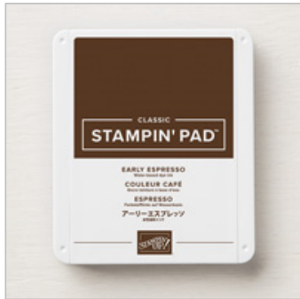
Early Espresso Classic Stampin' Pad