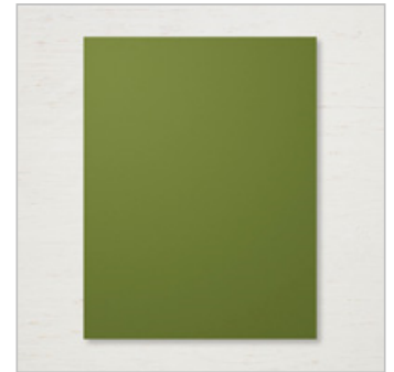
Mossy Meadow 8-1/2" X 11" Cardstock