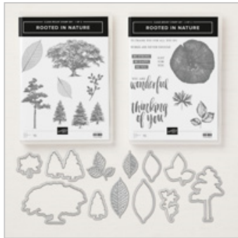
Rooted In Nature Clear-Mount Bundle