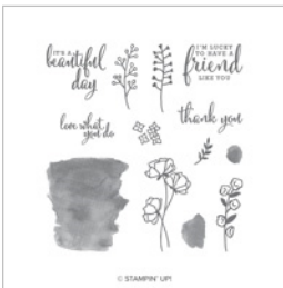
Love What You Do Photopolymer Stamp Set - 148042