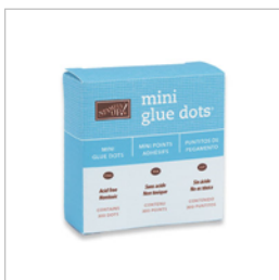
Mini Glue Dots - 103683