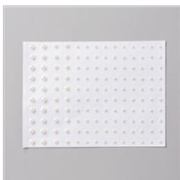
Pearl Basic Jewels - 144219