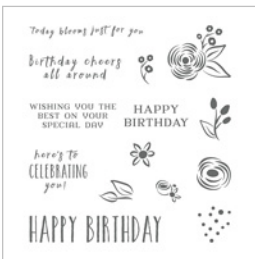
Perennial Birthday Clear-Mount Stamp Set - 145760