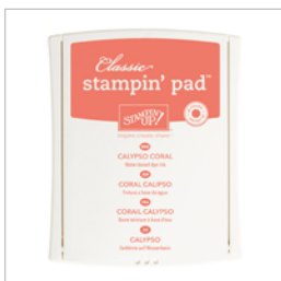
Calypso Coral Classic Stampin' Pad - 126983