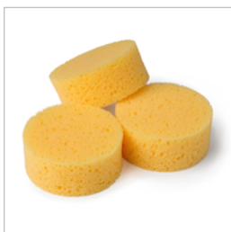
Stamping Sponges - 141337