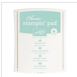
Pool Party Classic Stampin' Pad - 126982