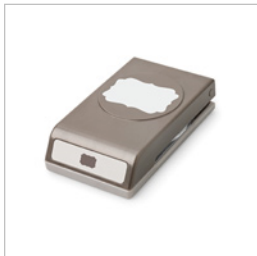
Decorative Label Punch - 120907