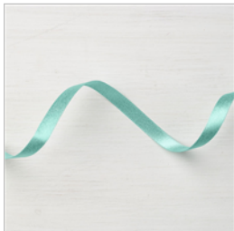
Pool Party 3/8" Shimmer Ribbon - 144152