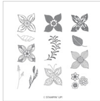
Pop Of Petals Clear-Mount Stamp Set