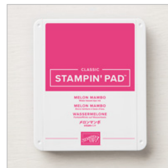
Melon Mambo Classic Stampin' Pad