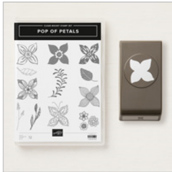
Pop Of Petals Clear-Mount Bundle