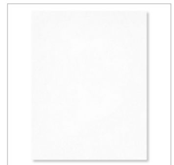
Shimmery White 8-1/2 X 11 Cardstock