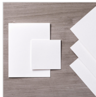
Whisper White 8-1/2 X 11 Thick Cardstock