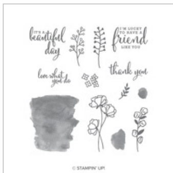
Love What You Do Photopolymer Stamp Set