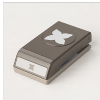
Four-Petal Flower Punch