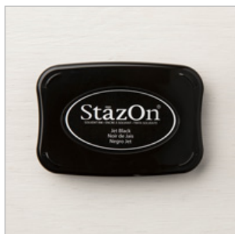
Jet Black Stazon Ink Pad