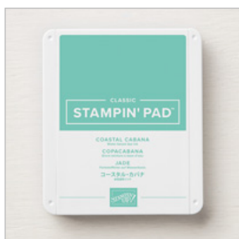
Coastal Cabana Classic Stampin' Pad