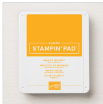
Mango Melody Classic Stampin' Pad