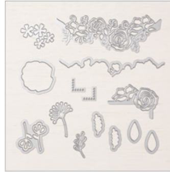
Lovely Flowers Edgelits Dies