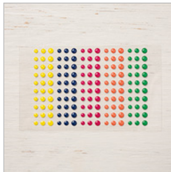
Happiness Blooms Enamel Dots