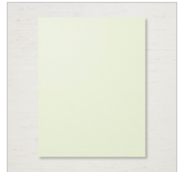
Soft Sea Foam 8-1/2" X 11" Cardstock