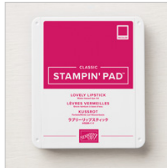
Lovely Lipstick Classic Stampin' Pad