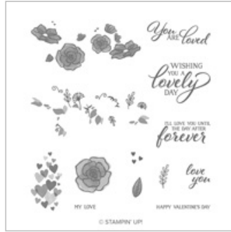
Forever Lovely Photopolymer Stamp Set