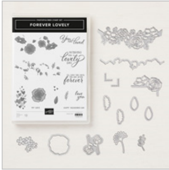
Forever Lovely Photopolymer Bundle