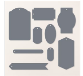
Greetings Of The Season Dies - 164112