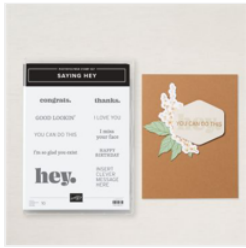
Saying Hey Photopolymer Stamp Set (English) - 163697

Stesha@stampinhoot.com https://stampinhoot.com/