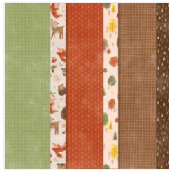
Sweet Days Of Autumn 12" X 12" (30.5 X 30.5 Cm) Designer Series Paper - 166498