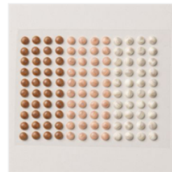
Adhesive-Backed Swirl Dots - 163464