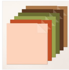
Autumn To Remember 12" X 12" (30.5 X 30.5 Cm) Two-Tone Cardstock - 166499