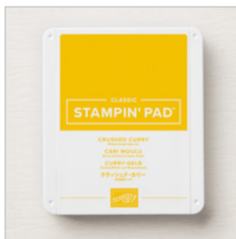
Crushed Curry Classic Stampin' Pad