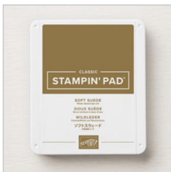
Soft Suede Classic Stampin' Pad