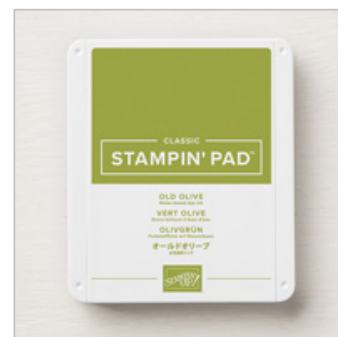
Old Olive Classic Stampin' Pad