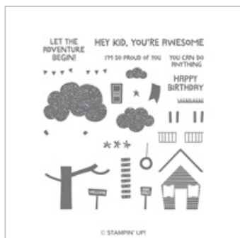
Treehouse Adventure Photopolymer Stamp Set

Stesha Bloodhart Stesha@stampinhoot.com www.stampinhoot.com