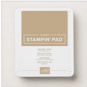
Crumb Cake Classic Stampin' Pad

Stesha Bloodhart Stesha@stampinhoot.com www.stampinhoot.com