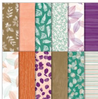
Nature's Poem Designer Series Paper