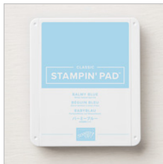
Balmy Blue Classic Stampin' Pad