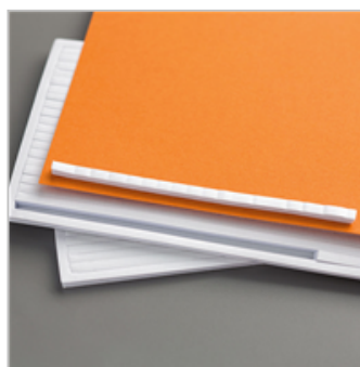
Foam Adhesive Strips