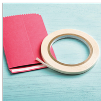
Tear & Tape Adhesive