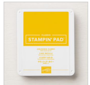
Crushed Curry Classic Stampin' Pad