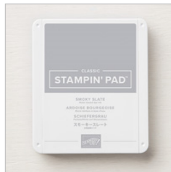
Smoky Slate Classic Stampin' Pad