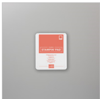
Terracotta Tile Classic Stampin' Pad