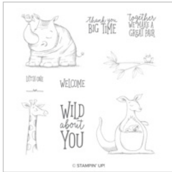
Animal Outing Cling-Mount Stamp Set