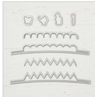
Playful Pennants Framelits Dies