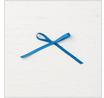
Blueberry Bushel 1/8" (3.2 Mm) Grosgrain