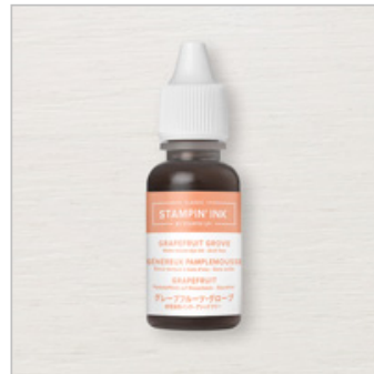
Grapefruit Grove Classic Stampin' Ink