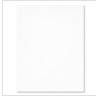
Shimmery White 8-1/2" X 11" Cardstock