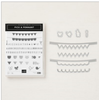
Pick A Pennant Photopolymer Bundle