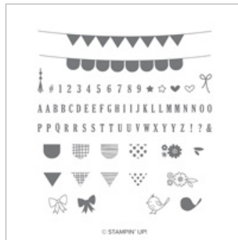
Pick A Pennant Photopolymer Stamp Set