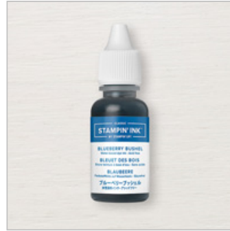
Blueberry Bushel Classic Stampin' Ink