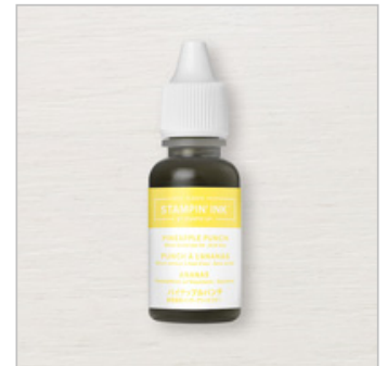
Pineapple Punch Classic Stampin' Ink