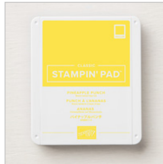
Pineapple Punch Classic Stampin' Pad