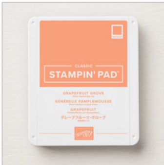
Grapefruit Grove Classic Stampin' Pad