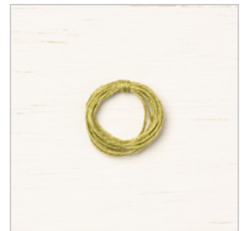
Old Olive Linen Thread