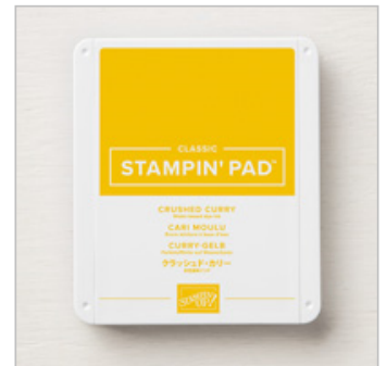
Crushed Curry Classic Stampin' Pad