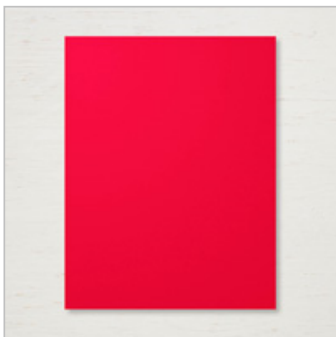
Poppy Parade 8-1/2" X 11" Cardstock