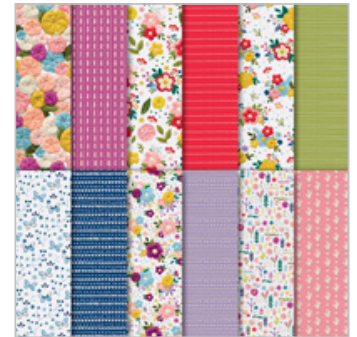
Needlepoint Nook 12"