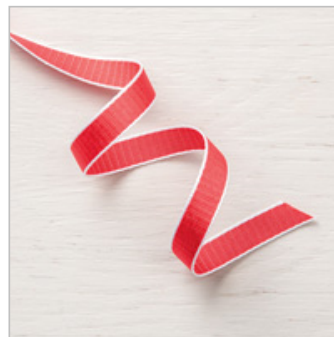
Poppy Parade 1/2" (1.3 Cm) Textured Weave Ribbon