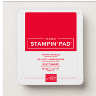
Poppy Parade Classic Stampin' Pad