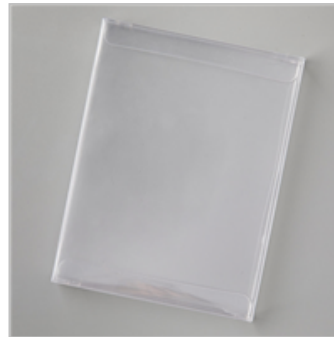
Acetate Card Boxes