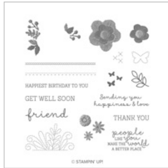
Needle & Thread Photopolymer Stamp