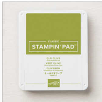
Old Olive Classic Stampin' Pad