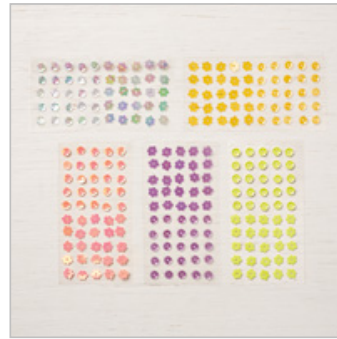
Gingham Gala Adhesive-Backed Sequins