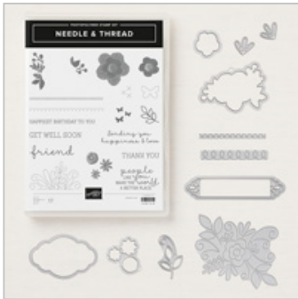
Needle & Thread Photopolymer Bundle

Stesha Bloodhart Stesha@stampinhoot.com www.stampinhoot.com