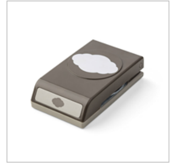
Pretty Label Punch