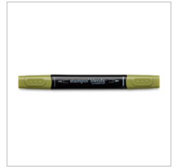
Old Olive Dark Stampin' Blends Marker