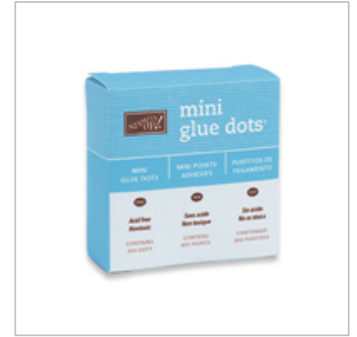
Mini Glue Dots