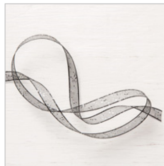
Black 5/8" (1.6 Cm) Glittered Organdy Ribbon