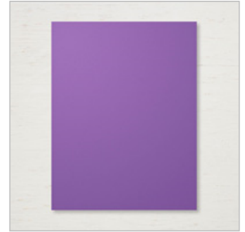
Gorgeous Grape 8-1/2" X 11" Cardstock 146987 Price: $8.50