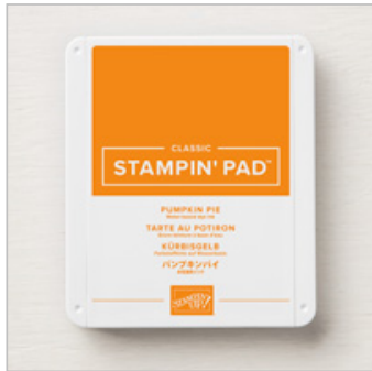
Pumpkin Pie Classic Stampin' Pad

Stesha Bloodhart Stesha@stampinhoot.com www.stampinhoot.com