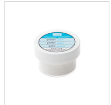
White Stampin' Emboss Powder