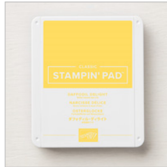
Daffodil Delight Classic Stampin' Pad