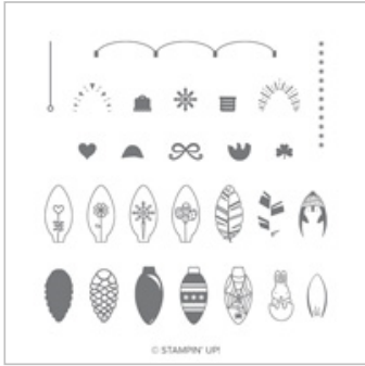
Making Every Day Bright Photopolymer Stamp Set 148813 Price: $16.00

Stesha Bloodhart Stesha@stampinhoot.com www.stampinhoot.com