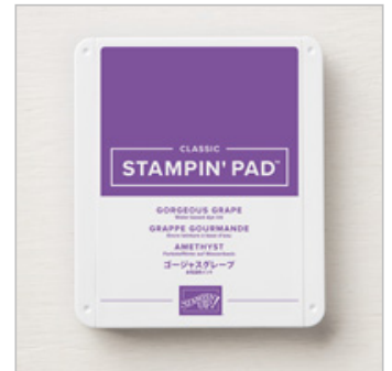
Gorgeous Grape Classic Stampin' Pad 147099 Price: $7.50