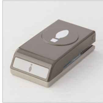
Christmas Bulb Builder Punch 148013 Price: $18.00