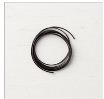
Black 1/8" (3.2 Mm) Cord