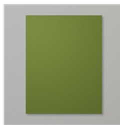
Mossy Meadow 8-1/2" X 11" Cardstock - 133676