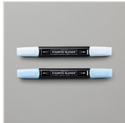
Seaside Spray Stampin' Blends Combo Pack - 154901