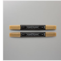
Soft Suede Stampin' Blends Combo Pack - 154906