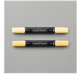
So Saffron Stampin' Blends Combo Pack - 154905