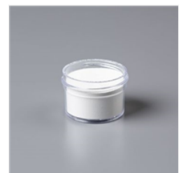
White Stampin' Emboss Powder - 109132