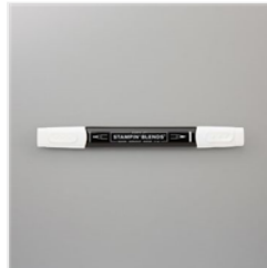
Stampin' Blends Color Lifter - 144608