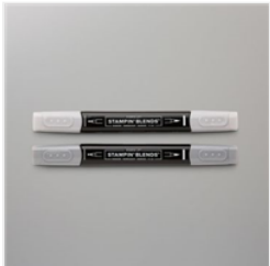
Stampin Blends Smoky Slate Combo Pack - 145058