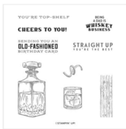
Whiskey Business Cling Stamp Set (En) - 152550

Stesha@stampinhoot.com https://stampinhoot.com/