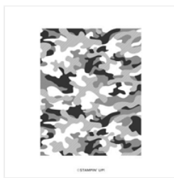
Camouflage Cling Stamp Set - 152547