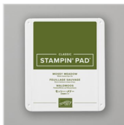
Mossy Meadow Classic Stampin' Pad - 147111