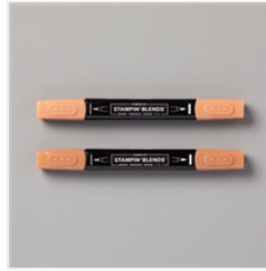
Cinnamon Cider Stampin' Blends Combo Pack - 153105