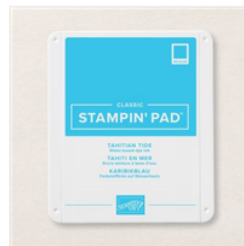
Tahitian Tide Classic Stampin' Pad - 159210