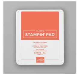
Calypso Coral Classic Stampin' Pad - 147101