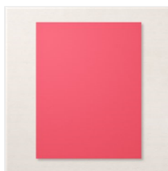
Sweet Sorbet 8- 1/2" X 11" Cardstock - 159268