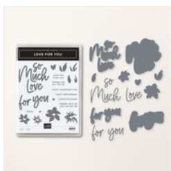
Love For You Bundle (English) - 160406