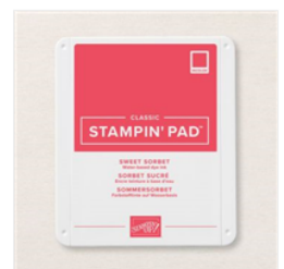
Sweet Sorbet Classic Stampin' Pad - 159216