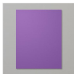
Gorgeous Grape 8-1/2" X 11" Cardstock - 146987