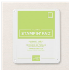
Parakeet Party Classic Stampin' Pad - 159208