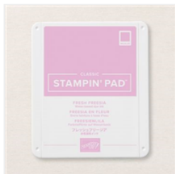
Fresh Freesia Classic Stampin' Pad - 155611