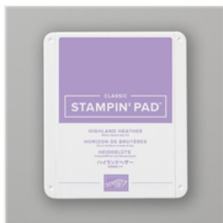
Highland Heather Classic Stampin' Pad - 147103