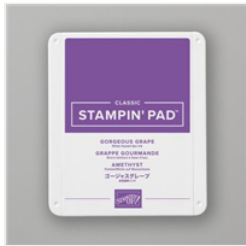
Gorgeous Grape Classic Stampin' Pad - 147099

Wendy Cranford wendy.cranford@live.com www.luvinstampin.com