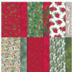
Boughs Of Holly 12" X 12" (30.5 X 30.5 Cm) Designer Series Paper - 159600