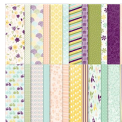
Design A Daydream 12" X 12" (30.5 X 30.5 Cm) Host Designer Series Paper - 159161