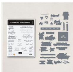
Charming Sentiments Bundle (English) - 158734