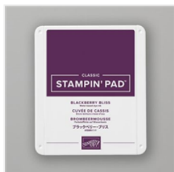
Blackberry Bliss Classic Stampin' Pad - 147092