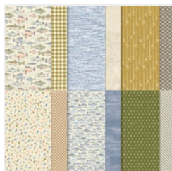
Let's Go Fishing 12" X 12" (30.5 X 30.5 Cm) Designer Series Paper - 161534