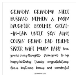
Best Family Ever Photopolymer Stamp Set (English) - 160720