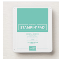
Coastal Cabana Classic Stampin' Pad - 147097