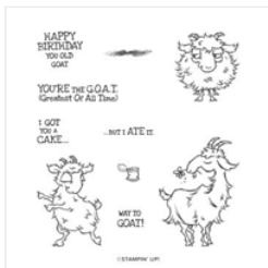
Way To Goat Cling Stamp Set (English) - 152657

7. Adhere the 11" piece of Whisper White to the center of the card front. Then put Stampin Dimensionals on the left of the Night of Navy rectangle and adhere it to accordian folded DSP. Be sure to only adhere it on one side so that you can open the card!