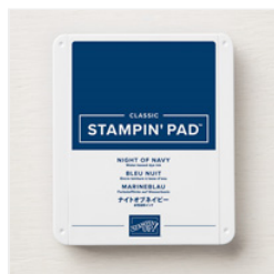
Night Of Navy Classic Stampin' Pad - 147110