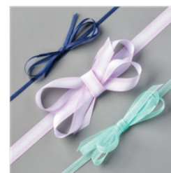
Playing With Patterns Ribbon Combo Pack - 152468