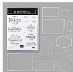
So Sentimental Bundle (English) - 153828