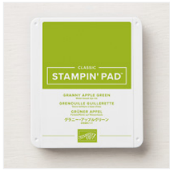
Granny Apple Green Stampin' Pad - 147095