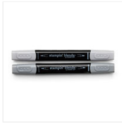
Smoky Slate Stampin' Blends Markers Combo Pack - 145058