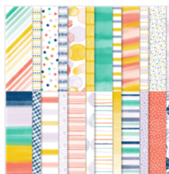
Playing With Patterns 6" X 6" (15.2 X 15.2 Cm) Designer Series Paper - 152490