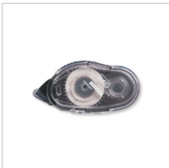
Snail Adhesive 104332 Price: $7.00