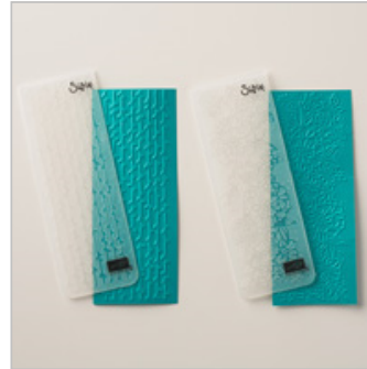
Petal Pair Textured Impressions Embossing Folders 145656 Price: $9.00