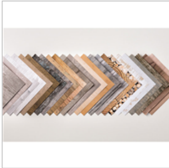
Wood Textures Designer Series Paper Stack 144177 Price: $10.00