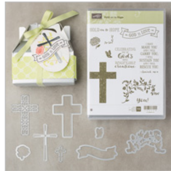
Hold On To Hope Wood-Mount Bundle