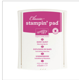
Berry Burst Classic Stampin' Pad