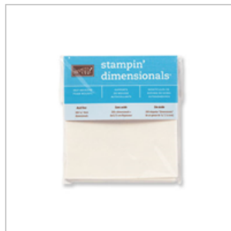
Stampin' Dimensionals 104430 Price: $4.00