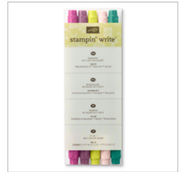
2017-2019 In Color Stampin' Write Markers