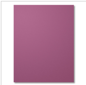
Fresh Fig 8-1/2" X 11" Cardstock