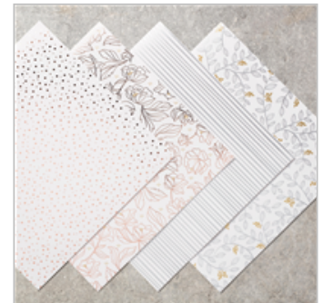
Springtime Foils Specialty Designer Series Paper