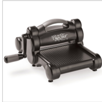
Big Shot 143263 Price: $110.00