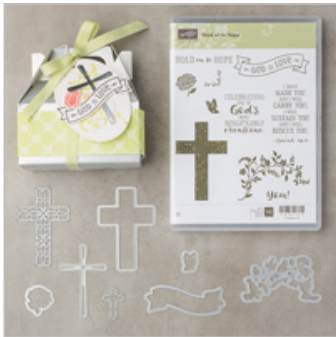
Hold On To Hope Clear-Mount Bundle