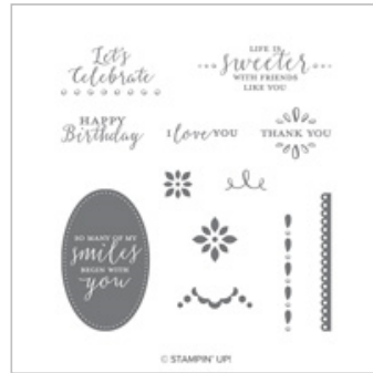
Detailed With Love Wood-Mount Stamp Set