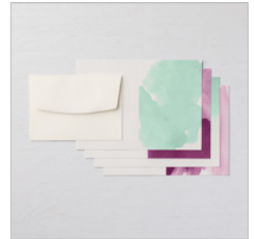
Delightfully Detailed Note Cards & Envelopes