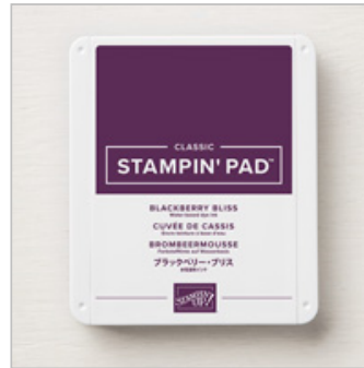
Blackberry Bliss Classic Stampin' Pad