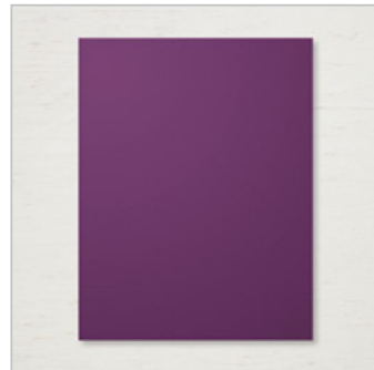
Blackberry Bliss 8- 1/2\"/>