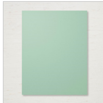
Mint Macaron 8-1/2\"/>