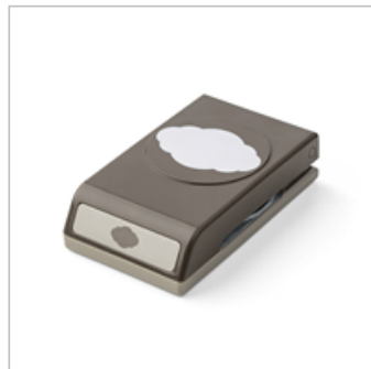
Pretty Label Punch