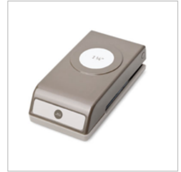
1-1/4" (3.2 Cm) Circle