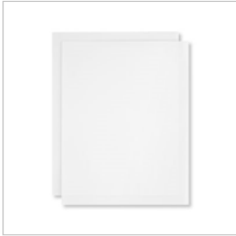
Vellum 8-1/2" X 11"

Christy Fulk christyfulk@createwithchristy.com http://createwithchristy.com/