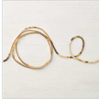
Gold Mini Sequin Trim