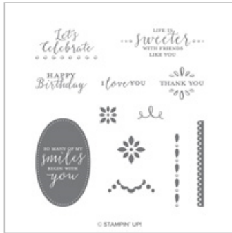
Detailed With Love Clear-Mount Stamp Set