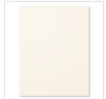
Very Vanilla 8-1/2\"/>