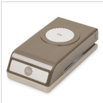
1-3/8" (3.5 Cm) Scallop Circle Punch