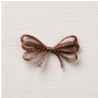
1/4" Copper Trim