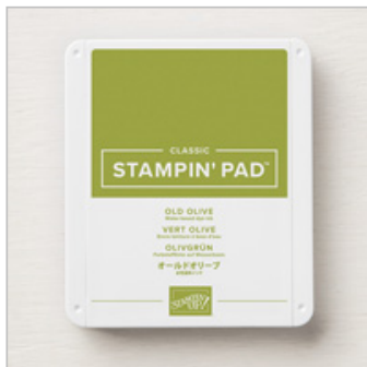
Old Olive Classic Stampin' Pad