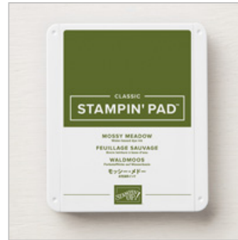
Mossy Meadow Classic Stampin' Pad