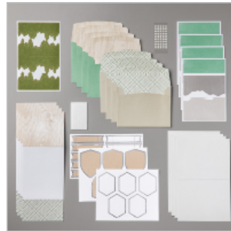
Manly Moments Kit Refill