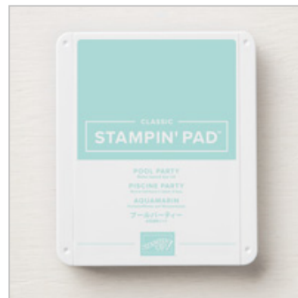
Pool Party Classic Stampin' Pad