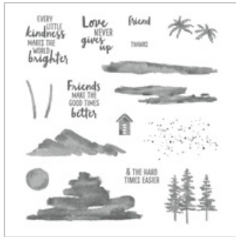
Waterfront Photopolymer Stamp