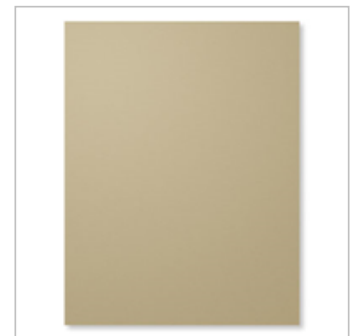
Crumb Cake 8-1/2" X 11" Cardstock