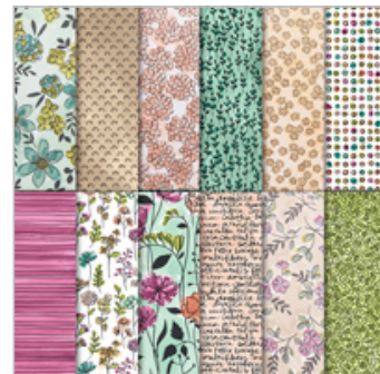
Share What You Love Specialty Designer Series Paper