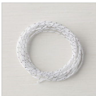
Silver Baker'S Twine