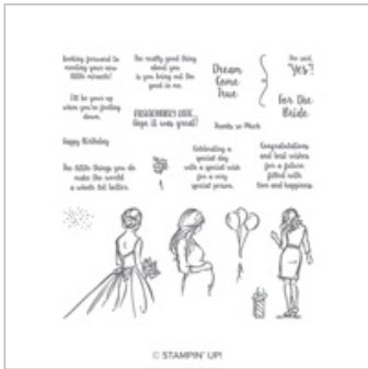
Wonderful Moments Photopolymer Stamp

Christy Fulk christyfulk@createwithchristy.com http://createwithchristy.com/