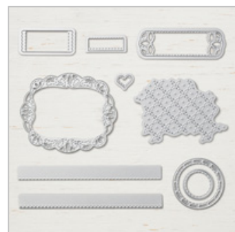
Stitched Labels Framelits Dies