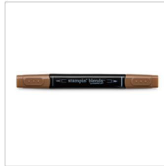
Bronze Stampin' Blends Marker