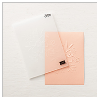
Lovely Floral Dynamic Textured Impressions Embossing Folder