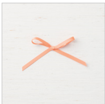
Grapefruit Grove 1/8\" (3.2 Mm) Grosgrain Ribbon