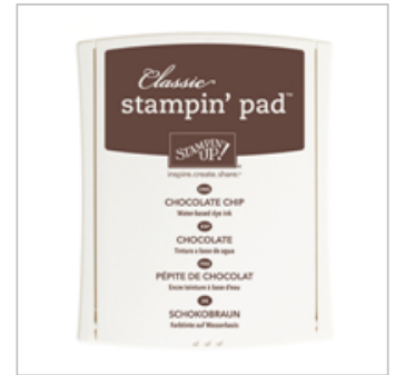
Chocolate Chip Classic Stampin' Pad