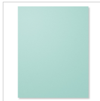
Pool Party 8-1/2" X 11" Cardstock