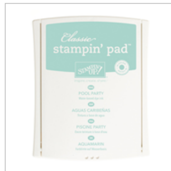
Pool Party Classic Stampin' Pad