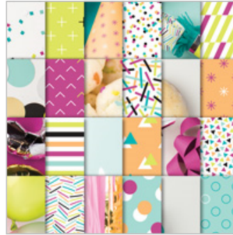
Picture Perfect Party 6" X 6" (15.2 X 15.2 Cm) Designer Series Paper