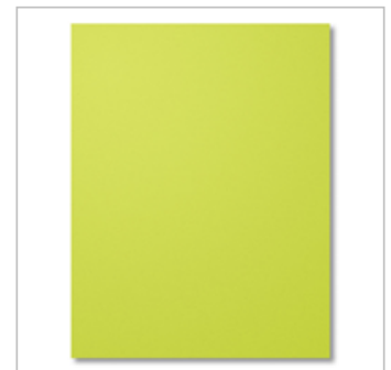
Lemon Lime Twist 8-1/2" X 11" Cardstock