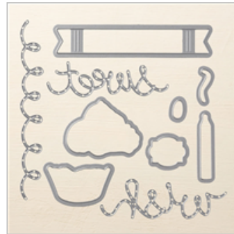
Cupcake Cutouts Framelits Dies