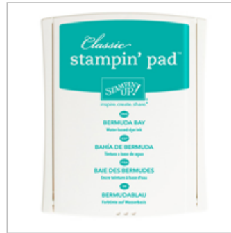
Bermuda Bay Classic Stampin' Pad