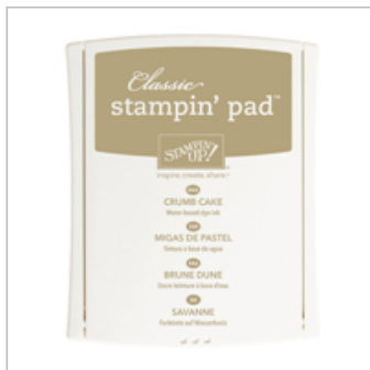
Crumb Cake Classic Stampin' Pad