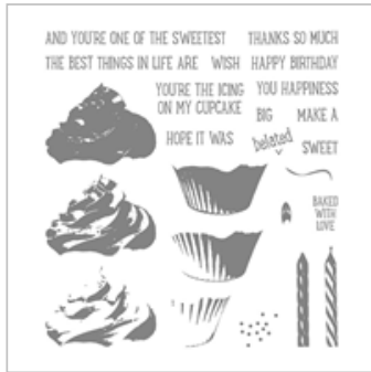
Sweet Cupcake Photopolymer Stamp