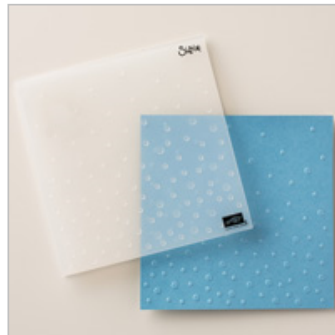
Scattered Sequins Dynamic Textured Impressions Embossing Folder