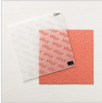
Climbing Vine Textured Impressions Embossing Folder

Christy Fulk christyfulk@createwithchristy.com http://createwithchristy.com/