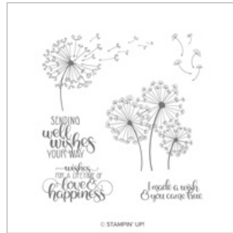
Dandelion Wishes Wood-Mount Stamp