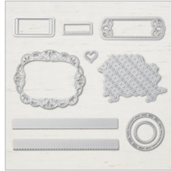
Stitched Labels Framelits Dies