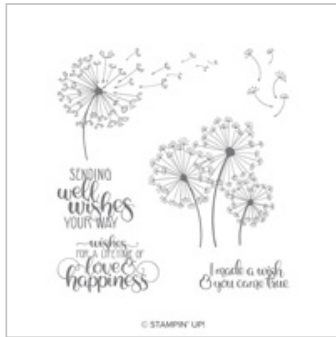
Dandelion Wishes Clear-Mount Stamp

Christy Fulk christyfulk@createwithchristy.com http://createwithchristy.com/