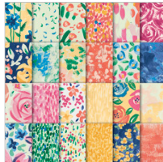
Garden Impressions 6" X 6" (15.2 X 15.2 Cm) Designer Series