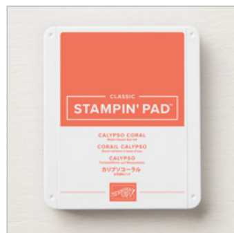
Calypso Coral Classic Stampin' Pad