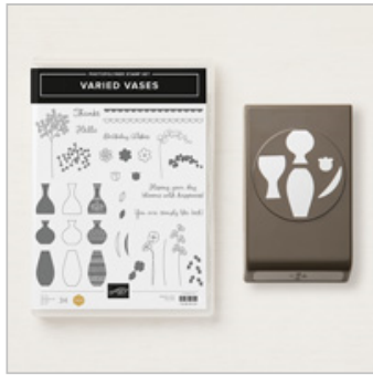
Varied Vases Photopolymer Bundle

Christy Fulk christyfulk@createwithchristy.com http://createwithchristy.com/