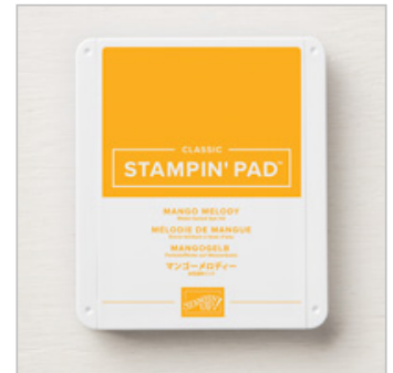
Mango Melody Classic Stampin' Pad