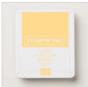
So Saffron Classic Stampin' Pad

Christy Fulk christyfulk@createwithchristy.com http://createwithchristy.com/