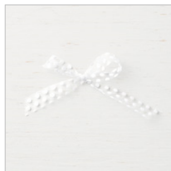
Whisper White 5/8" (1.6 Cm) Polka Dot Tulle Ribbon