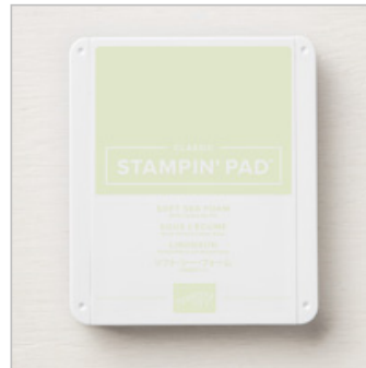
Soft Sea Foam Classic Stampin' Pad