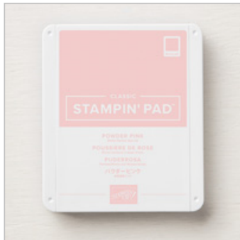
Powder Pink Classic Stampin' Pad