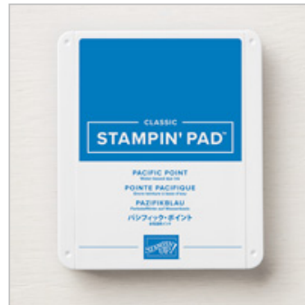
Pacific Point Classic Stampin' Pad