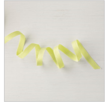
Lemon Lime Twist 3/8" (1 Cm) Mini Striped Ribbon