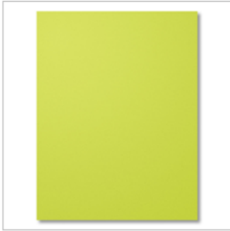
Lemon Lime Twist 8-1/2" X 11" Cardstock

Christy Fulk christyfulk@createwithchristy.com http://createwithchristy.com/