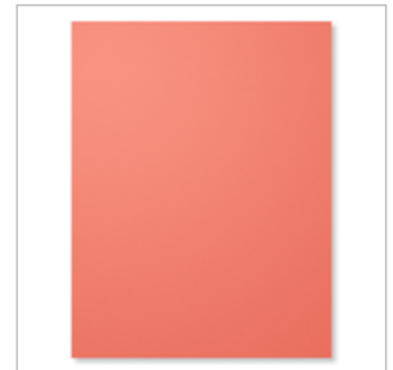
Calypso Coral 8-1/2" X 11" Cardstock 122925 Price: $8.00