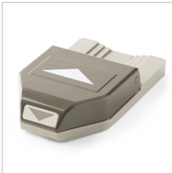
Banner Triple Punch