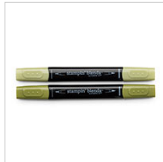
Old Olive Stampin' Blends Markers Combo Pack 144597 Price: $9.00