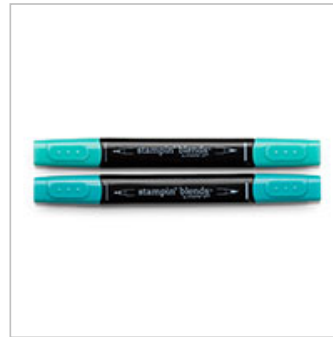
Bermuda Bay Stampin' Blends Markers Combo Pack 144600 Price: $9.00