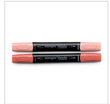
Calypso Coral Stampin' Blends Markers Combo Pack 144045 Price: $9.00