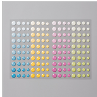
Glitter Enamel Dots