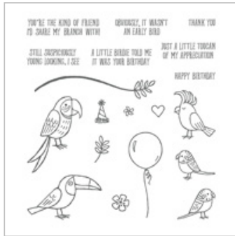
Bird Banter Photopolymer Stamp Set 145852 Price: $17.00

Christy Fulk christyfulk@createwithchristy.com http://createwithchristy.com/