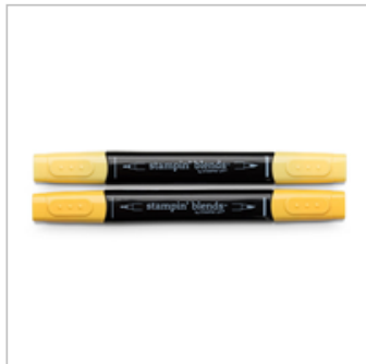
Daffodil Delight Stampin' Blends Markers Combo Pack 144603 Price: $9.00