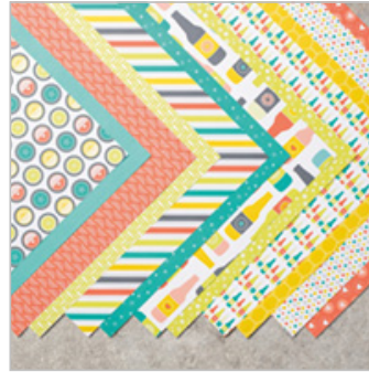
Bubbles & Fizz Designer Series Paper