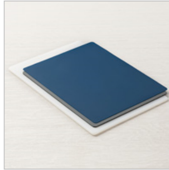
Big Shot Embossing Mats