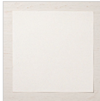
Sparkle Glimmer Paper