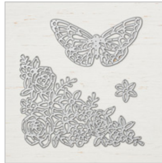
Springtime Impressions Thinlits Dies