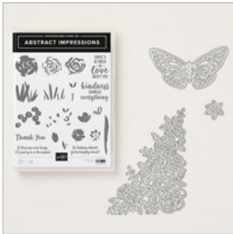
Abstract Impressions Photopolymer Bundle

Christy Fulk christyfulk@createwithchristy.com http://createwithchristy.com/