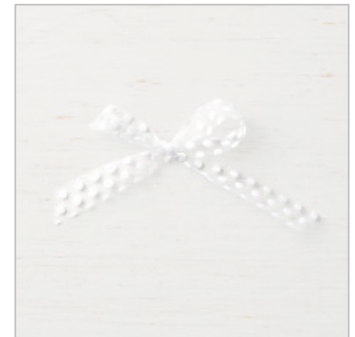
Whisper White 5/8" (1.6 Cm) Polka Dot Tulle Ribbon