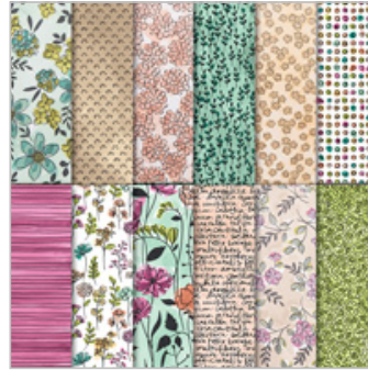
Share What You Love Specialty Designer Series Paper