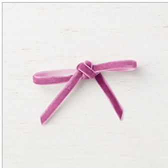
Rich Razzleberry 1/4" (6.4 Mm) Velvet Ribbon