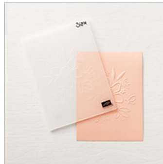
Lovely Floral Dynamic Textured Impressions Embossing Folder