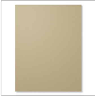
Crumb Cake 8-1/2" X 11" Cardstock

Christy Fulk christyfulk@createwithchristy.com http://createwithchristy.com/