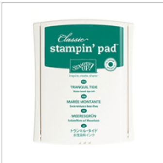
Tranquil Tide Classic Stampin' Pad