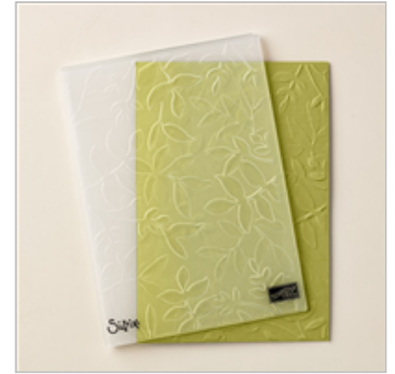
Layered Leaves Dynamic Textured Impressions Embossing Folder