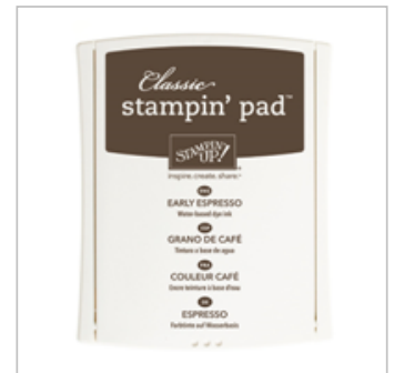
Early Espresso Classic Stampin' Pad