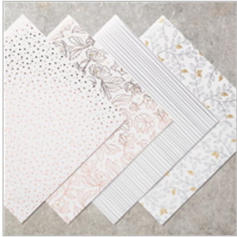
Springtime Foils Specialty Designer Series Paper