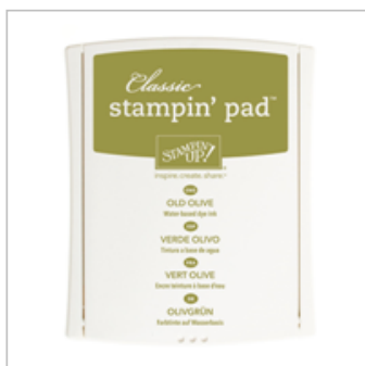
Old Olive Classic Stampin' Pad