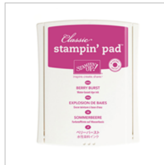
Berry Burst Classic Stampin' Pad