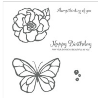
Beautiful Day Wood-Mount Stamp Set