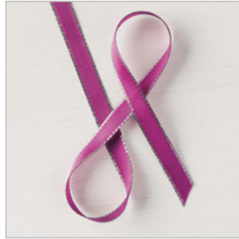
Berry Burst 3/8" (1 Cm) Metallic-Edge Ribbon