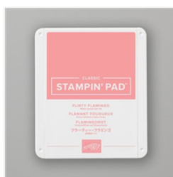
Flirty Flamingo Classic Stampin' Pad - 147052