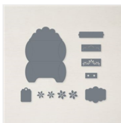
Pretty Pillowbox Dies - 156321