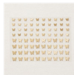
Brushed Brass Butterflies - 158136