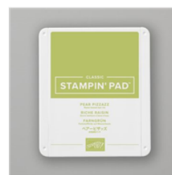
Pear Pizzazz Classic Stampin' Pad - 147104