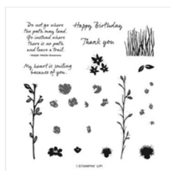
Wildflower Path Photopolymer Stamp Set (English) - 157735