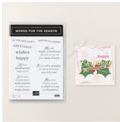
Words For The Season Cling Stamp Set (English) - 165716