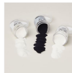
Basics Wow! Embossing Powder - 165679