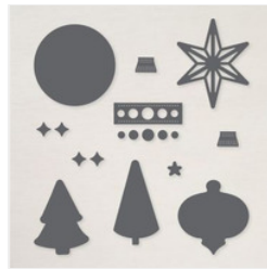
Ornamental Christmas Dies - 166000