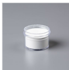
White Stampin' Emboss Powder - 109132