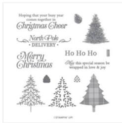
Perfectly Plaid Photopolymer Stamp Set (En) - 149418

Mary Fish mary@stampinpretty.com http://stampinpretty.com