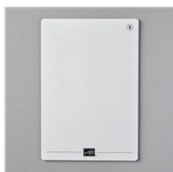
Magnetic Cutting Plate - 149656