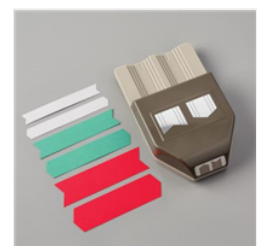
Banners Pick A Punch - 153608