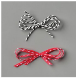
Playful Pets Trim Combo Pack - 152466