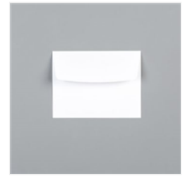
Whisper White Medium Envelopes - 107301