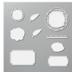
Painted Labels Dies - 151605