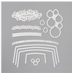
Envelopes Dies - 153531