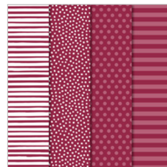
Neutrals 6" X 6" (15.2 X 15.2 Cm) Designer Series Paper