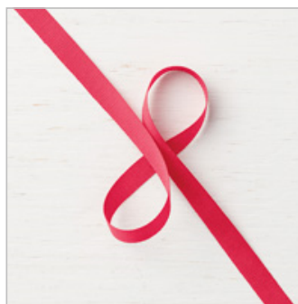
Real Red 3/8" (1 Cm)