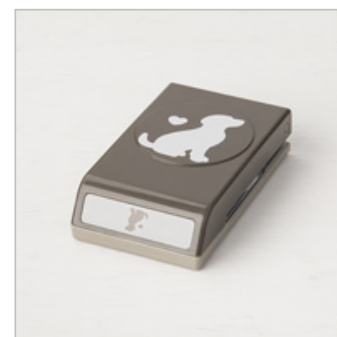
Dog Builder Punch