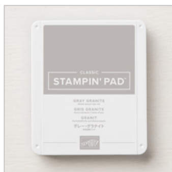
Gray Granite Classic