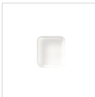
Clear Block A