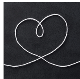
Whisper White Solid