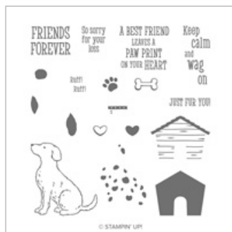
Happy Tails Photopolymer Stamp Set