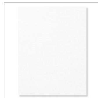
Whisper White 8-1/2\"/>