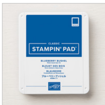
Blueberry Bushel Classic Stampin' Pad