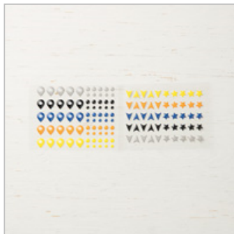
Best Route Enamel