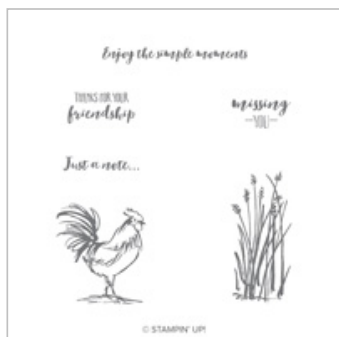
Home To Roost Cling Stamp Set