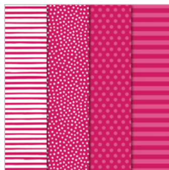
In Color 2018-2020 6\"/>