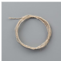
Linen Thread - 104199