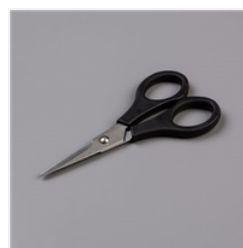
Paper Snips Scissors - 103579