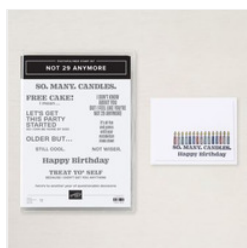
Not 29 Anymore Photopolymer Stamp Set (English) - 166182