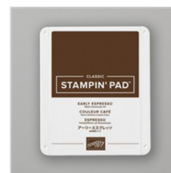
Early Espresso Classic Stampin' Pad - 147114