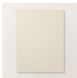
Basic Beige 8-1/2" X 11" Cardstock - 164511