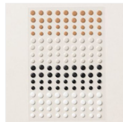
Neutral Matte Dots - 165561