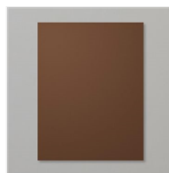
Early Espresso 8-1/2" X 11" Cardstock - 119686