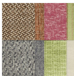
Need For Tweed 12" X 12" (30.5 X 30.5 Cm) Designer Series Paper - 166144