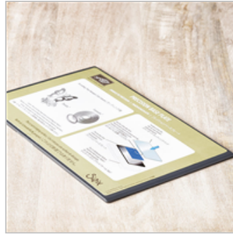
Precision Base Plate