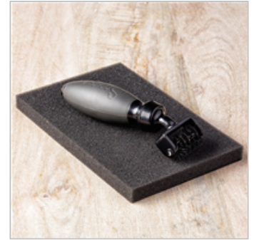
Big Shot Die Brush - New Configuration