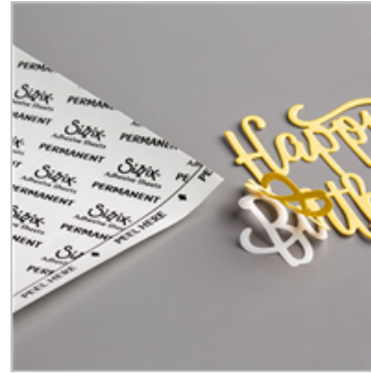
Multipurpose Adhesive Sheets