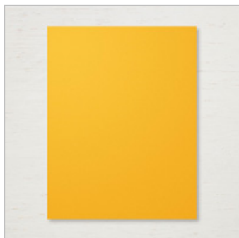
Mango Melody 8-1/2" X 11" Cardstock