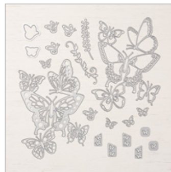
Butterfly Beauty Thinlits Dies