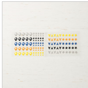
Best Route Enamel Shapes