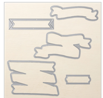
Bunch Of Banners Framelits Dies