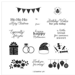
Stamp Set Cling Little Treats - 153376

Mary Fish mary@stampinpretty.com http://stampinpretty.com