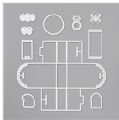
Little Treat Box Dies - 153571