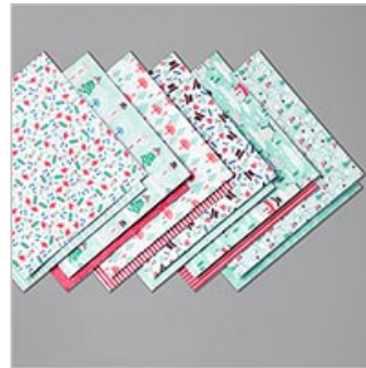
Let It Snow Specialty Designer Series Paper