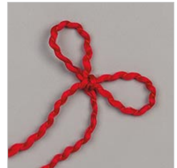
Real Red 1/8" (3.2 Mm) Curly Ribbon