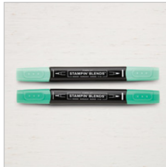
Call Me Clover Stampin' Blends Markers Combo Pack