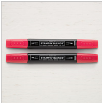
Real Red Combo Pack Stampin' Blends