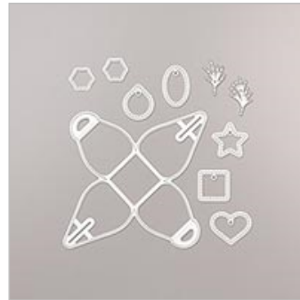
Mini Curvy Keepsakes Box Dies