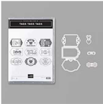
Tags Tags Tags Bundle (En)