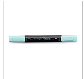
Pool Party Dark Stampin' Blends Marker