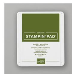
Mossy Meadow Classic Stampin' Pad - 147111