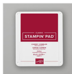
Cherry Cobbler Classic Stampin' Pad - 147083