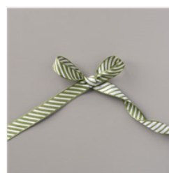
Mossy Meadow 3/8" (1 Cm) Diagonal Stripe Ribbon - 153542