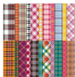
Plaid Tidings 6" X 6" (15.2 X 15.2 Cm) Designer Series Paper - 153527