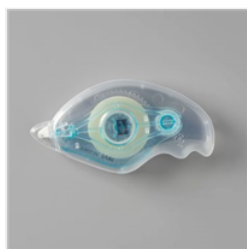
Stampin' Seal - 152813