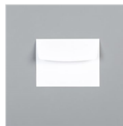
Whisper White Medium Envelopes - 107301