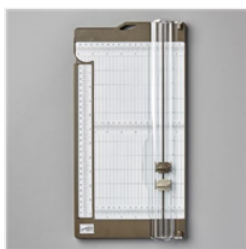
Paper Trimmer - 152392

Mary Fish mary@stampinpretty.com http://stampinpretty.com