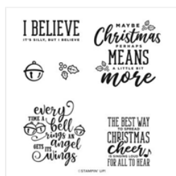
Christmas Means More Photopolymer Stamp Set - 154730

Mary Fish mary@stampinpretty.com http://stampinpretty.com