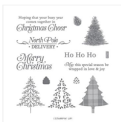
Perfectly Plaid Photopolymer Stamp Set (En) - 149418