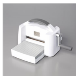
Stampin' Cut & Emboss Machine - 149653