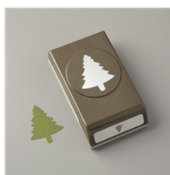
Pine Tree Punch - 149521