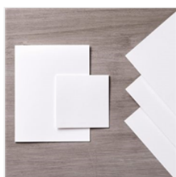
Whisper White 8-1/2" X 11" Thick Cardstock - 140272