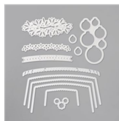
Envelopes Dies - 153531