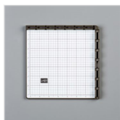
Stamparatus - 146276