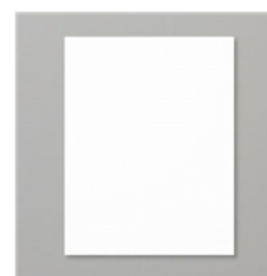
Whisper White 8-1/2" X 11" Cardstock - 100730