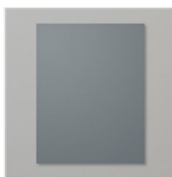
Basic Gray 8-1/2" X 11" Cardstock - 121044