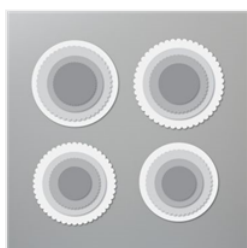
Layering Circles Dies - 151770